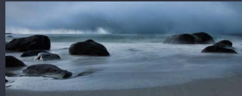
“STORM AT MULEVIKA” NOK 13.500,- (175x70cm)