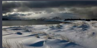
“SHADOWS” NOK 9.500,- (130x70cm)