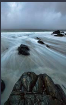
“TIDE” NOK 14.100,- (90x150cm)