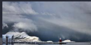
“MOLJA WINTER” NOK 18.500,- (200x100cm)