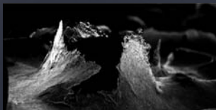
“BROKEN” NOK 21.000,- (200x100cm)