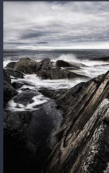
“ULLA ROCKS” NOK 14.900,- (110x180cm)