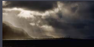
“ALNES LIGHTHOUSE” NOK 9.500,- (150x70cm)