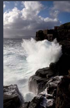
“SVINØY POWER” NOK 14.900,- (110x180cm)