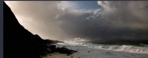
“REALITY” NOK 14.700,- (200x70cm)