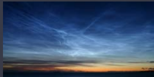
“NIGHT SHINING CLOUDS” NOK 10.600,- (145x70cm)