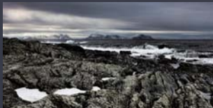
“ALNES SHORE” NOK 8.900,- (130x70cm)